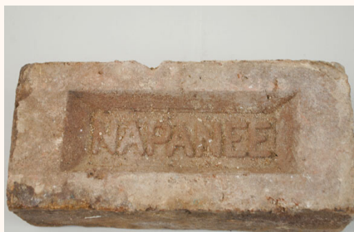
L&A County Museum and Archives - Napanee Brick and Tile Works

The goal for today is to build a house out of any building material you have at home. You can use popsicle sticks, lego, Lincoln logs, wooden blocks etc. While you are building, imagine you were building your first home in your new home of Upper Canada. We would love to see your buildings! Please share on Facebook @County Museum