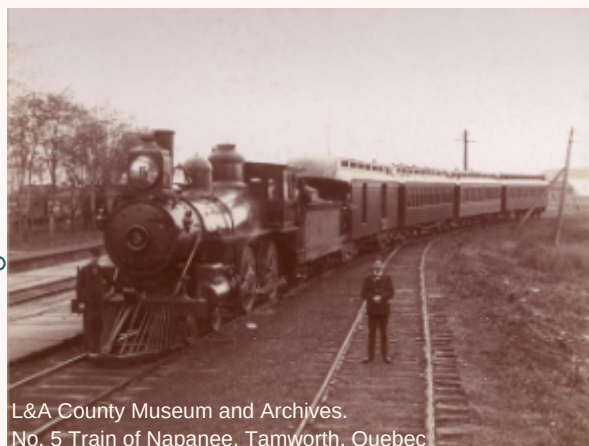
No. 5 Train of Napanee, Tamworth, Quebec

Today's project: Ask your parents to help you find some recycling that you can use to build your own train! Paint, decorate and create different types of train cars for the products or people who you will be bringing on your trip. You can even make your own train track, station and village. Use your imagination to create your own village! We would love to see your trains, share on Facebook @CountyMuseum.