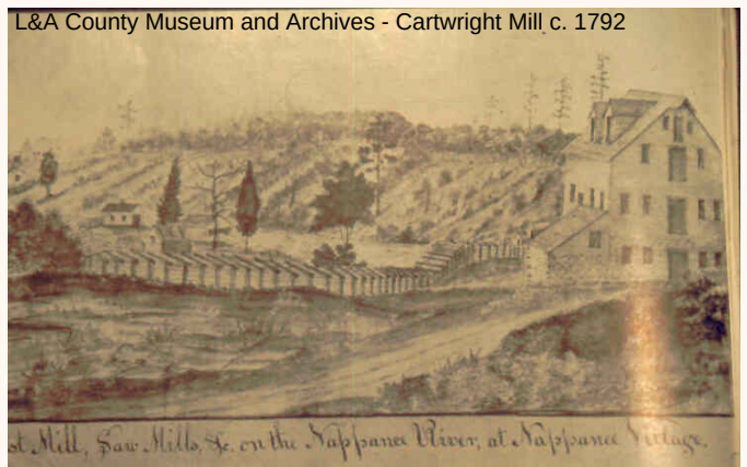
L&A County Museum and Archives - Cartwright Mill c. 1792

Time to get your thinking caps on and imagine life 100-200 years ago. What problems would they have faced without the amenities we are used to today. Now, the fun part, develop a business or product to solve that problem. For inspiration visit our E-History Project so learn about early local business owners. https://e-history.lennox-addington.on.ca/index.html We would love to see the inventions or businesses you create! Please share on Facebook @CountyMuseum.